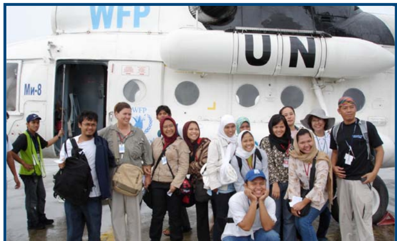
The Helping Hands Team

If you would like more information on how you, or your organization, can come alongside our continued outreach by contributing towards our community development programs please contact us.